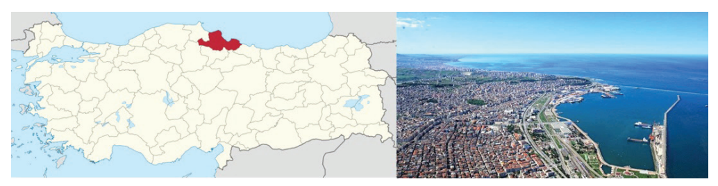
Figure 1: Samsun province

As seen in Figure 1, Samsun is a province situated in the middle side of the Black Sea Region of Turkey. It played an essential role in the years of national struggle and is described as "the Black Sea" and "the city of Atatürk." The city has been the most important city of the region in terms of social, economic, historical and geography, and also has become an essential focal point of the region with its culture, education, health, and tourism infrastructure (Yılmaz, 2011; Arslan, 2016). The city has the highest population density in the region (Zeybek, 2006), with a population of 1.348.542 in 2019 (Turkstat, 2019).