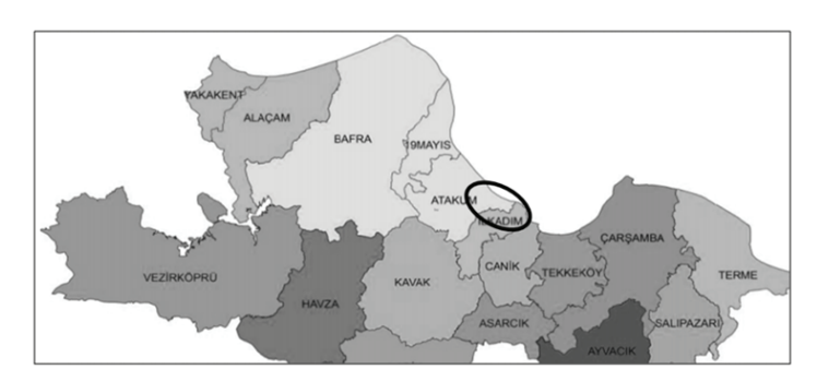
Figure 2: The location of the residential areas in the city selected for the study

In the third part, the participants were asked to evaluate the environment of the house. Environmental assessments consisted of two questions under two main headings. The first question, consisting of 19 sub-questions, examined features such as the regularity of the environment, the suitability of the environment for children and the elderly, and parking facilities in 5 different scales. The second question focused on what facilities were lacking in the environment. In the 4th chapter, which included social relations, neighborhood relations were examined. In this section, the participants were asked to evaluate the issues of neighborly relations, solidarity, borrowing small items from neighbors, frequency of meeting with relatives, and acquaintance with tradespeople. In the questions, similar to those in other sections, satisfaction level was measured on five different scales. In this direction, the fifth part of the field study consisted of evaluations regarding access to services. In this section, participants were asked a single question under 11 subtitles and asked to evaluate them in a 5-point Likert type. The section consisted of criteria such as the workplace, school, hospital, market, access to shopping areas.