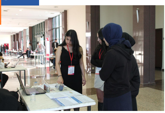
International Project Market on Turning Thoughts into Reality