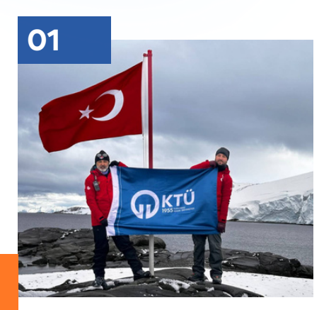
National Antarctic Science Expedition