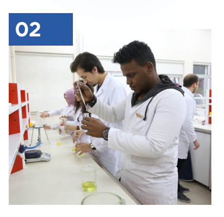
OECD Good Laboratory Practices